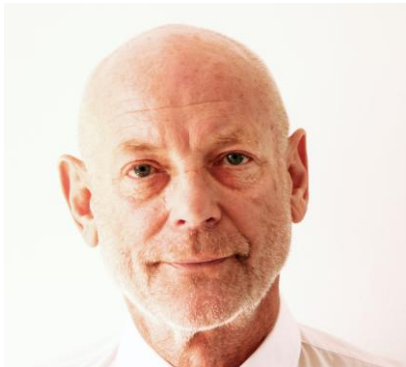
Joop Keesmaat: Lead Actor